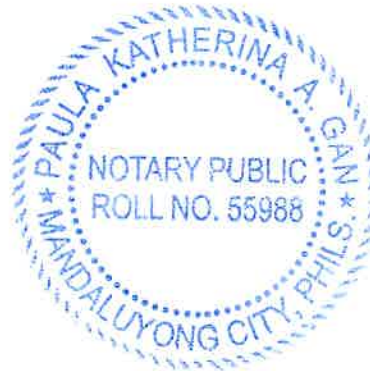
PAULA KATHERINA A. GAN

Doc No.: 213 ; Page No.: C14 ; Book No.: VII ; Series of 2021